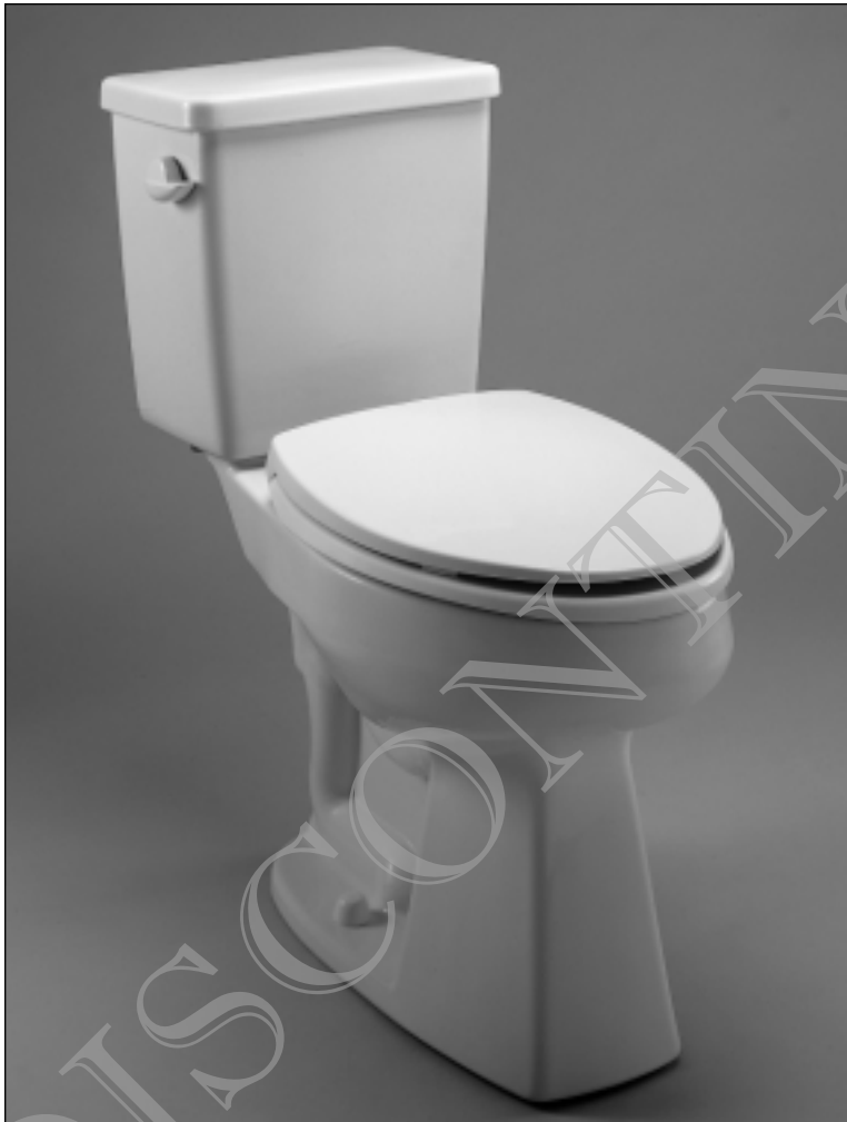
CST704L.14 - 1.6 GPF Toilet SS114 - SoftClose Toilet Seat